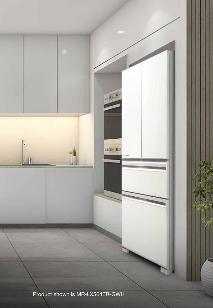
Product shown is MR-LX564ER-GWH