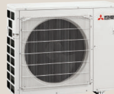
1 x MXZ-4F80VGD-A1