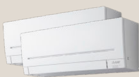
2 x MSZ-AP25VGKD2-A2