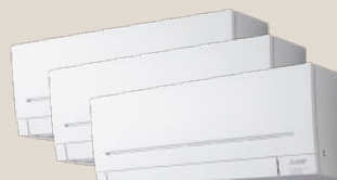
2 x MSZ-AP25VGKD2-A2, 1 x MSZ-AP35VGKD2-A2