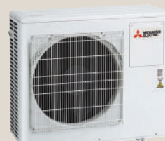
1 x MXZ-4F71VGD-A1