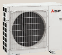
1 x MXZ-5F100VGD-A1