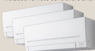
3 x MSZ-AP25VGKD2-A2