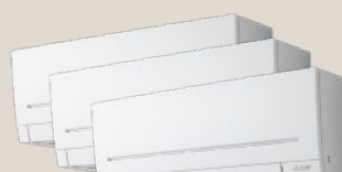
3 x MSZ-AP25VGKD2-A2