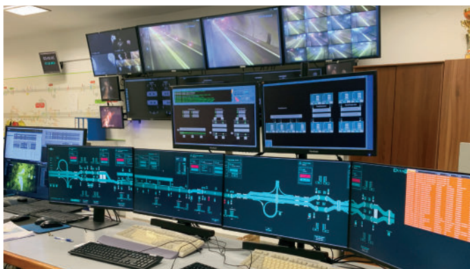
Autocesta Zagreb-Macelj Command Center

The Autocesta Zagreb-Macelj needed an advanced system that could enhance the existing SCADA and that could