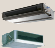
Indoor Units PEFY-P125VMA-E x 1 PEFY-P40VMA-A x 2 PEFY-P80VMHS-E x 1 PEFY-P71VMHS-E x 1 PEFY-P63VMHS-E x 1