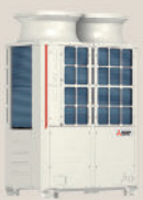
Outdoor Units PUHY-P600YSNW-A x 1 PURY-P400YNW-A x 1 PUHY-P300YNW-A x 2