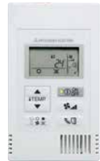
H 120 x W 70 x D 14.5mm