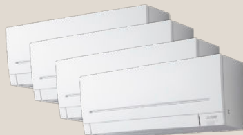
4 x MSZ-AP25VGKD2-A2