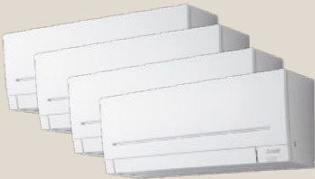
4 x MSZ-AP22VGD-A1