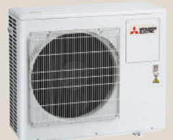
1 x MXZ-4F71VGD-A1