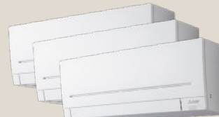
2 x MSZ-AP22VGD-A1, 1 x MSZ-AP35VGD2-A1