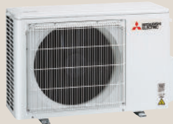
1 x MXZ-2F52VGD-A1