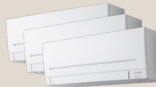
3 x MSZ-AP22VGD-A1