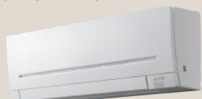
1 x MSZ-AP50VGD2-A1