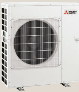
1 x MXZ-5F100VGD-A1