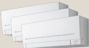
3 x MSZ-AP22VGD-A1