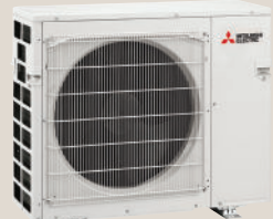
1 x MXZ-4F80VGD-A1