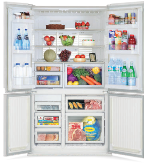
L4 Mini Glass