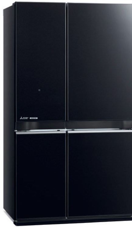
L4 Mini Glass