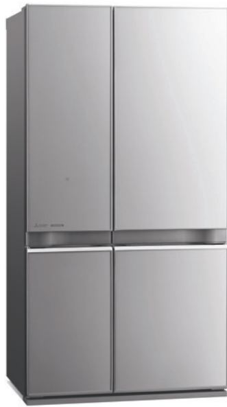
L4 Grande Glass