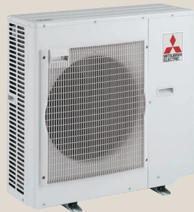
1 x MXZ-5E100VAD2-A1