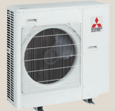
1 x MXZ-4E71VAD2-A1