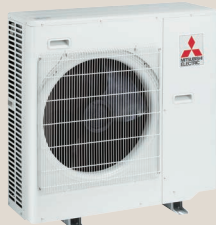
1 x MXZ-4E80VAD2-A1