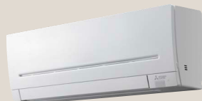
1 x MSZ-AP50VGD-A1