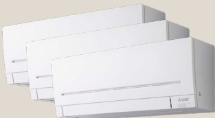
3 x MSZ-AP22VGD-A1