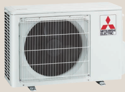
1 x MXZ-2D52VA2-A1