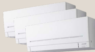
3 x MSZ-AP22VGD-A1