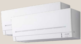
2 x MSZ-AP22VGD-A1