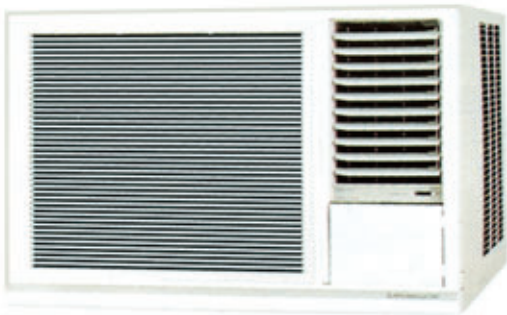
Reverse Cycle Cooling/Heating